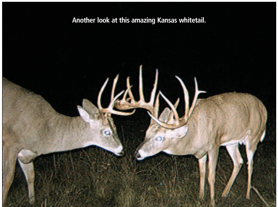
Another look at this amazing Kansas whitetail.

One hour later, we headed back out to track him. It was pretty tough finding blood at the start because he had run quite fast, so we opted to begin tracking at the last place I had seen him. Once we found that spot, the blood got thicker and frothy, and we suspected he wouldn't be too far away. We had tracked him for another 20 minutes when our friend the landowner found one of his sheds from the previous year. Shortly after that, we saw the magnificent buck lying along a trail of huge rubs that we believed were his.