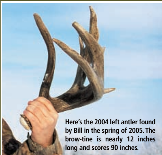
Here's the 2004 left antler found by Bill in the spring of 2005. The brow-tine is nearly 12 inches long and scores 90 inches.