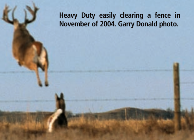
Heavy Duty easily clearing a fence in November of 2004.